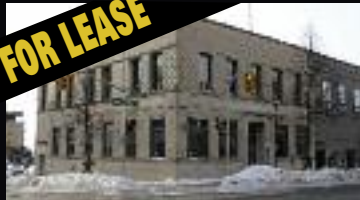
29 Cumberland St. S.