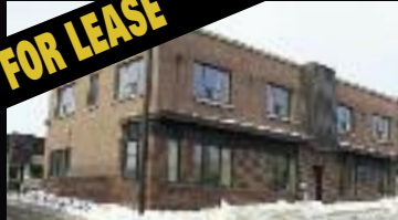
215 Van Norman Street