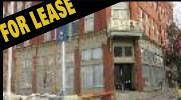
40 Cumberland St. S.